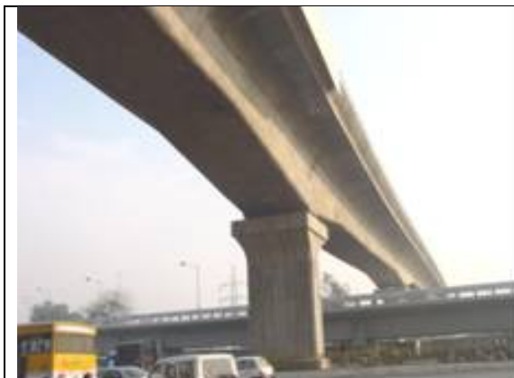
Fig.3: Line 1 Cast-in-Situ 3 span Continuous Structure (32.5m+46.2m+32.5m)