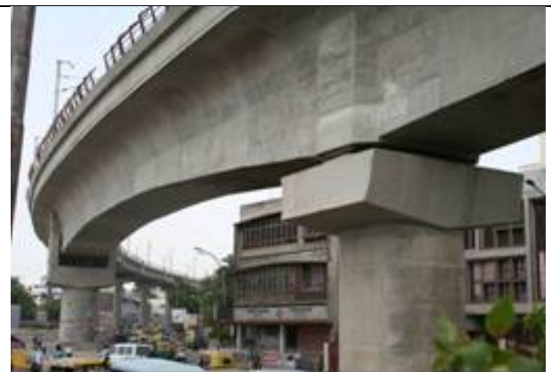
Fig.4: Line 3: Cast-In-Situ 4-Span Segmental Construction (38.5m+55.0m+38.5m+38.5m)